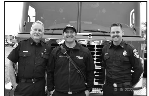
Thank you to Riverside County Fire Station #68